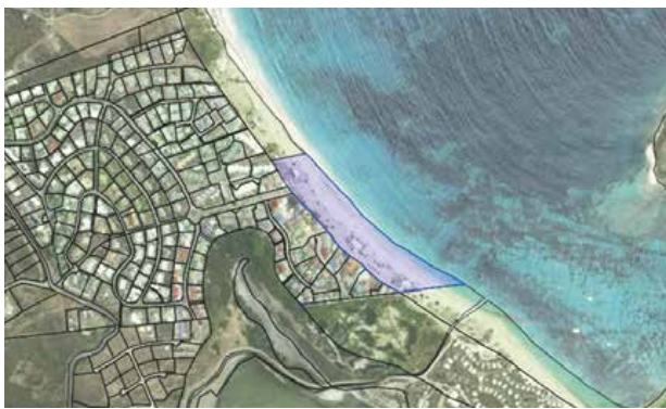
Parcel AW33 at Orient Bay

The occupants of these establishments, visually quite strange, do not have registration in the commercial register and therefore have no legal existence. In other words, they do not pay TGCA and do not declare any staff. As for the drink vendors, the bu-