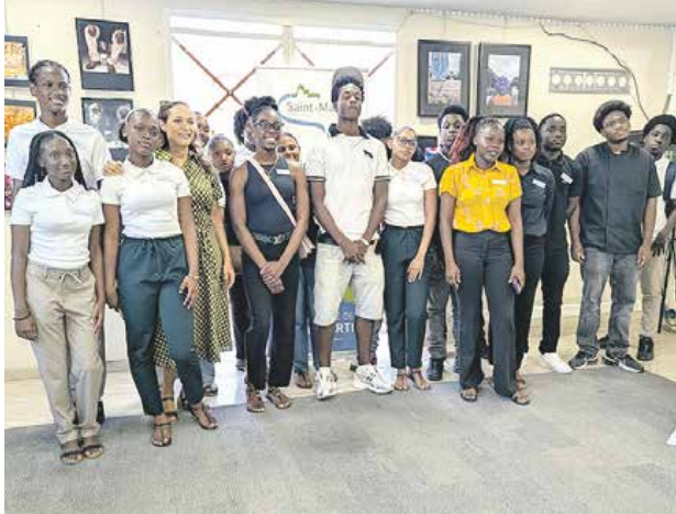
High school seniors in culinary baccalaureate at Daniella Jeffry vocational school.

on the environment and current societal issues. The exhibition remains freely accessible in the hall of the Territorial Collectivity until April 24. L.G