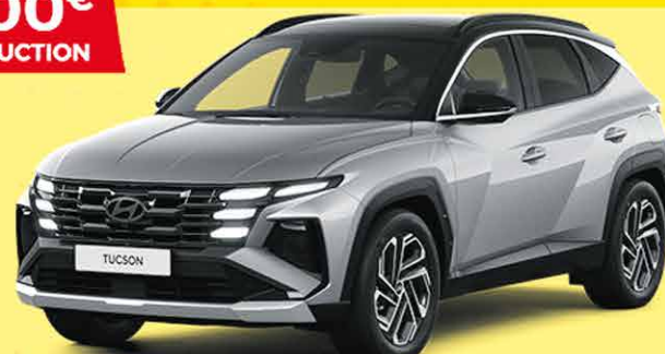
HYUNDAI TUCSON HYBRID